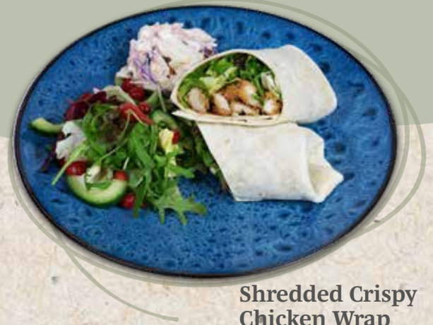
Shredded Crispy Chicken Wrap

Garnished with croutons, served with bloomer bread. See specials boards for flavour options.