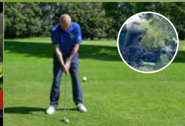
Golf & Fishing