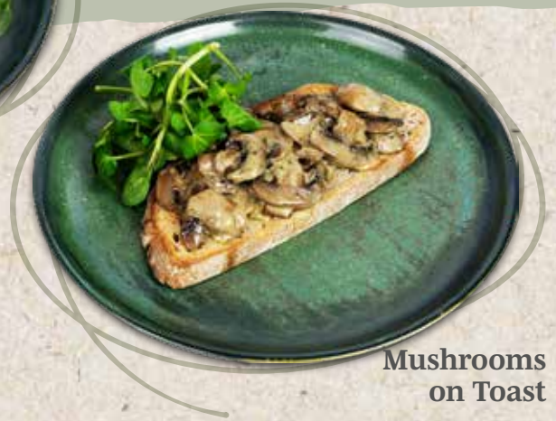
Mushrooms on Toast

Toasted sourdough bread, topped with seasoned, sliced sauteed mushrooms topped with watercress.