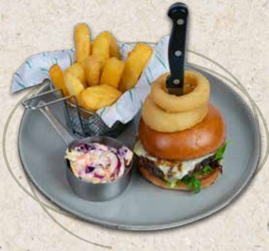
Classic Cheese Burger

Omelette topped with tomato, sliced sautéed mushrooms, red onion, cheese, served with chips and salad garnish.