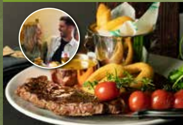
Woody's Restaurant & Bar