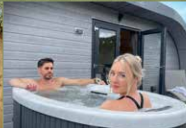
Private Saunas & Hot Tubs