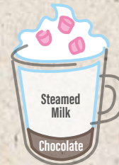
Hot Chocolate Special