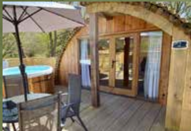
Luxury Lodges & Pods

Lodges • Cabins • Couples Pods • Holiday Cottages • Holiday Caravans • Touring Park